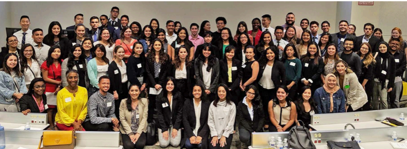
HCC, CDIP and KP interns from Southern California and the Coachella Valley pose for a 2019 group photo.

HCC provides this 2019 internship report to our CDIP health partners: HASC, Barstow Community Hospital, City of Hope, Fountain Valley Hospital, MedPOINT Management, Long Beach Medical Center/MemorialCare, White Memorial Medical Center & our HASC member partner, Kaiser Permanente.