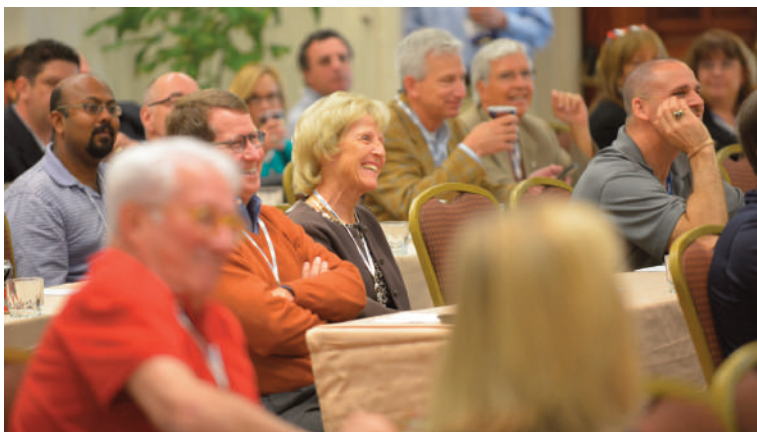
Educational and inspirational sessions motivated participants.