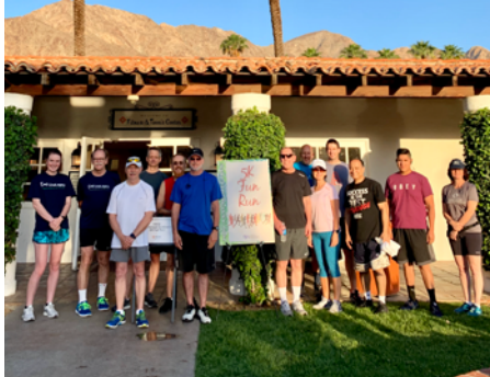
Runners in the HASC Fun Run