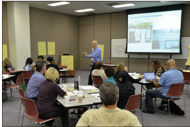
Health care professionals attended a HASC-led lean course in 2014.

Enhancing safety and ensuring better outcomes are the course's goals. Lean concepts can help improve focus, problem solving, follow-through