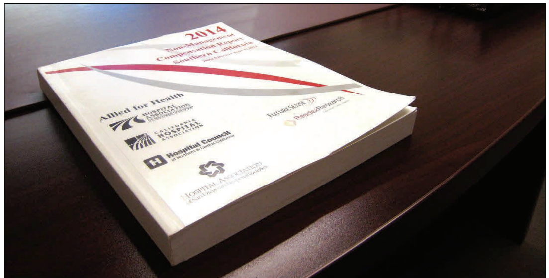
HASC and Allied for Health annual compensation reports are the region's go-to source for accurate and comprehensive data on salaries, benefits and other compensation trends.