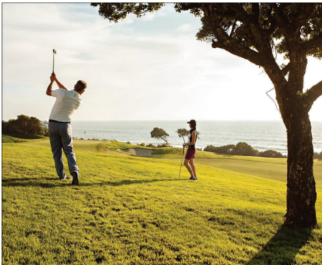
The St. Regis Monarch Beach's 18-hole golf course drops from the Tuscan-style hotel to just a 9-iron shot from the world-class surfing break at Salt Creek.

Registration is open for the 2016 HASC Annual Meeting scheduled for April 13 – 15 at the St. Regis Monarch Beach resort at Dana Point.