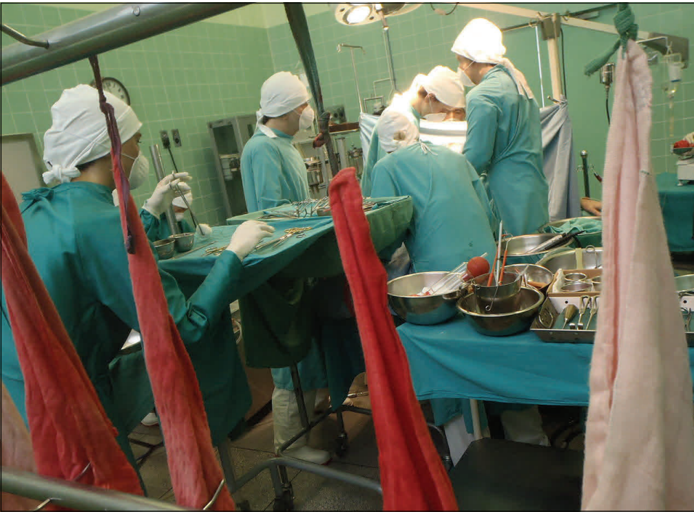
South African surgeon Dr. Christian Barnard completed the world's first heart transplant in a Cape Town hospital in 1967.

OneLegacy, an organ-donation nonprofit supported by more than 100 HASC-member hospitals, has set a national record for organ donations coordinated in a single year.