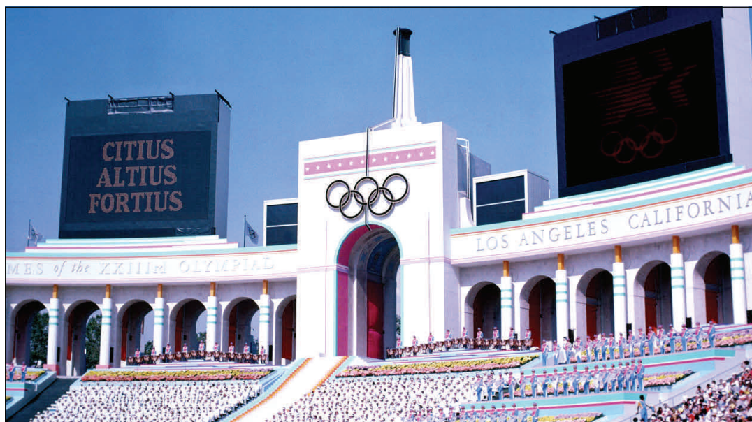
An early version of the ReddiNet emergency medical communications network went to work during the 1984 Los Angeles Olympic Games. HASC trademarked the system two years later, in 1986.