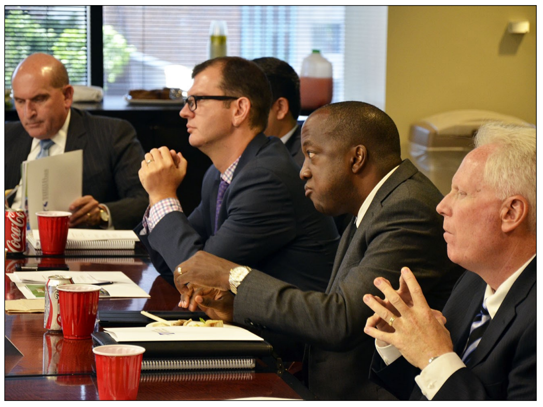
Associate member representatives focused their attention on a trio of speakers at Sept. 21's Associate Member Luncheon. Associate membership gives participants access to select educational events, informational publications and other resources.

Approximately 30 associate member representatives attended a luncheon and information session at HASC headquarters in downtown Los Angeles on Sept. 21.