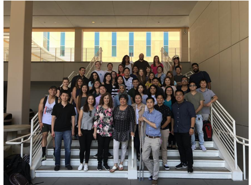
CSU Dominguez Hills – CLS Grads 2018