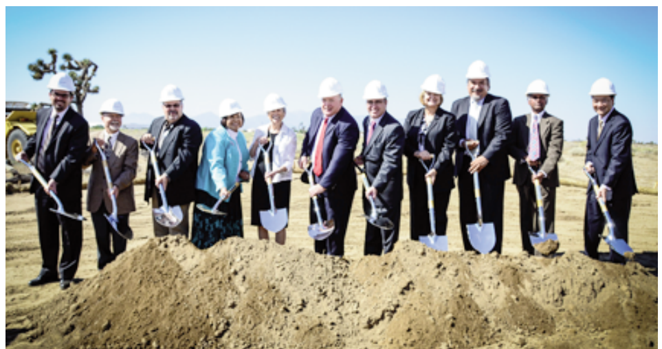
Officials break ground at the St. Joseph Health, St. Mary Victorville campus, set to open in April 2016.