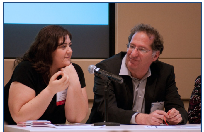
Right: Panelists from Saint John's Health Center - John Wayne Cancer Institute and Children's Hospital Los Angeles highlight wellness programs that work