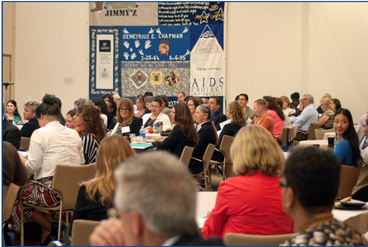
Guests discuss wellness strategies during main event and breakout sessions