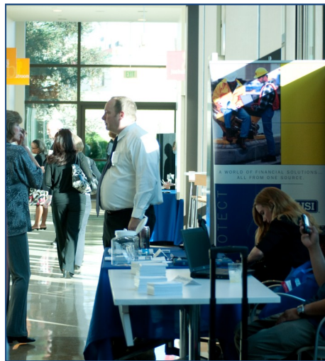
Guests visit sponsor booths in the exhibit hall at the California Endowment