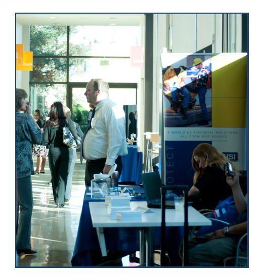
Guests visit sponsor booths in the exhibit hall at the California Endowment